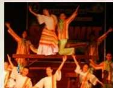
Students from the College of Nursing and Allied Health Sciences (CNAHS) stun the eyes of the audience with their astounding folk dances during the celebration of Buwan ng Wika.