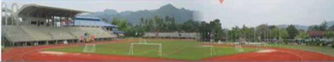
The University Sports Complex accommodates over 30,000 thousand participants and spectators of 2011 Palarong Pambansa.