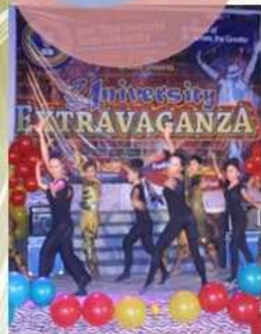
The talented members of JRMSU Lundayan Dance Troupe display their modern dancing prowess during the University Extravaganza.

The National Service Training Program (NSTP) of the University, which aimed at enhancing civic consciousness and defense preparedness in the youth. Aside from the giving lectures on entrepreneurship and leadership development, the NSTP get involved in community service, such as participating in tree planting activities and coastal clean-up drive in some coastal areas of the Province of Zamboanga del Norte.