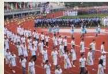
Athletes from the five campuses of the University parade during annual University Week Celebration.