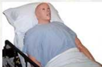
The METI Man, a controlled machine operated laboratory facility, is the highlight of the University's nursing laboratory.