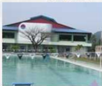
The University Gym with the swimming pool in frontage, is the seat of various academic and socio-cultural activities in the campus.