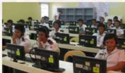
Maritime students enhance their speaking ability in the JEEP Laboratory.