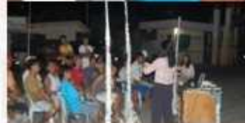
(Top – Bottom) JRMSU conducts 3Y Orientation Seminar with air/seaport porters, tour guides, and tricycle and “habal-habal” drivers, bus operators as participants.