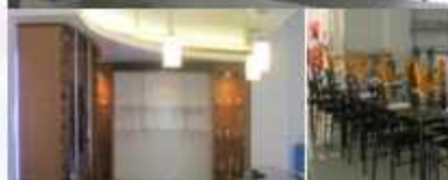
The CHED-funded Php 19-M HRM Laboratory consists of a lecture room with demo facilities for HRM students. The equipment included meet the standard set by CHED.