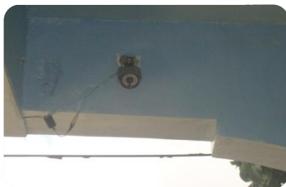
16 Units CCTV Camera