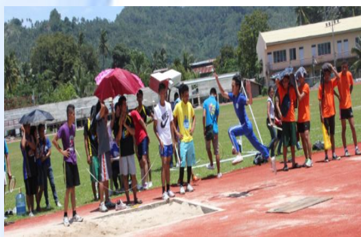
Long Jump Competition