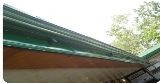
Installation of Fascia Board Cover at College of Education