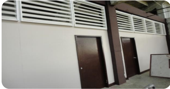
Painting of Agricultural Engineering Classrooms at the Grandstand