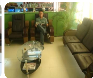
Visitors and Staff Lounge