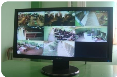
CCTV Camera Monitor & Cdr