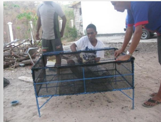
Figure 3 The fabrication and netting of the cage

A total of 1000 juveniles were deployed in Tablolong and Bolok reefs which included 191, one-year old Hippopus hippopus ( 37.17 \pm 6.62 mm) and 801 three-month old T. squamosa ( 3.75 \pm 0.95 mm) individuals on November 19, 2012 (Figures 4-5).