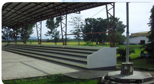
Painting of the Bleacher of Covered Court (Completed)