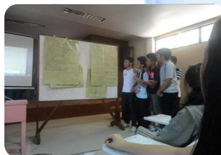
Seminar on Counseling the Youth held at CNAHS Audio-Visual Room, JRMSU - Main Campus, Dapitan City on August 22, 2012