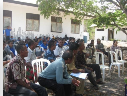
Figure 2 Consultation with the Vice Mayor of Kupang and Kepala Desa of Tablong (left) and fisherfolks of Tablolong, Bolok and Batu Bau (right)