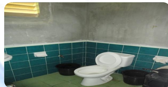
Electrical Installation – Extension of Two (2) – Storey IT Building (Phase I)