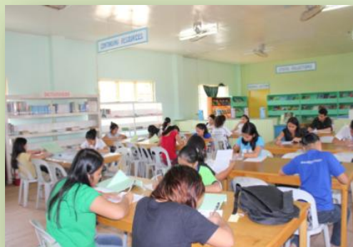
Timpalak sa Pagsulat