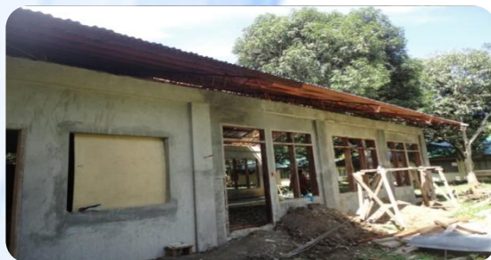
Construction of One (1) Class Room- Corporate High School