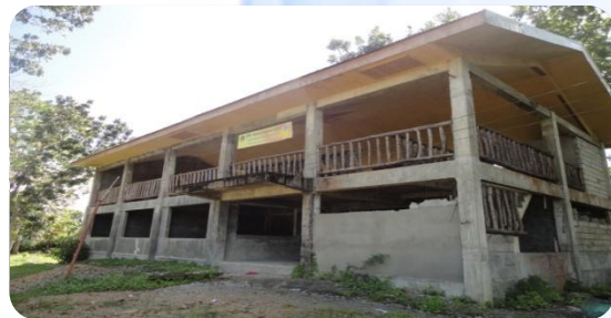
Completion of Two (2) – Story Alumni Building