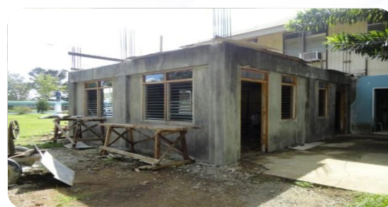
Construction of the Extension of the IT Building (Two-Storey)