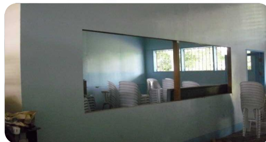
Partition of Supply Office (On-going)