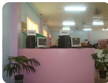
Online Public Access Catalog Station