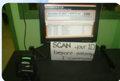
E-Lib Statistical Barcode System