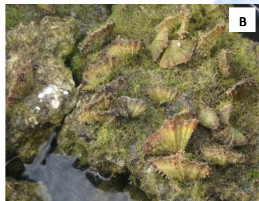
Figure 4 A. At Tablolong Beach with the head of BBIP, Dr. Naguit and Tablolong fisherfolks. B. H. hippopus juveniles ready for restocking.