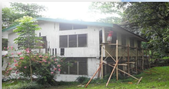
Reparation of Boys' Dormitory