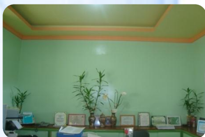
Office of the Librarian