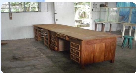
Construction of Office Tables (On-going)