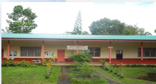
Renovation of College of Arts and Sciences Building