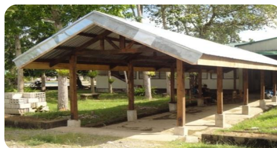
Construction of Covered Walk - Science and Education Building