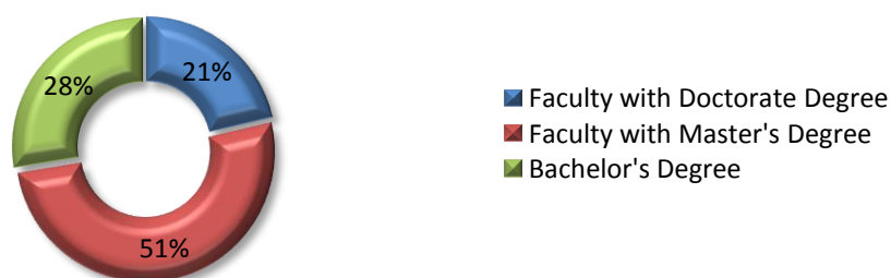
Figure 1 University Faculty Profile