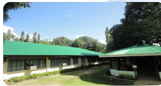
Repainting of Roofing of Various School Building Facilities (Phase I)