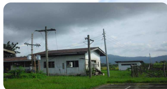
Installation of Secondary Electric Line (Completed)