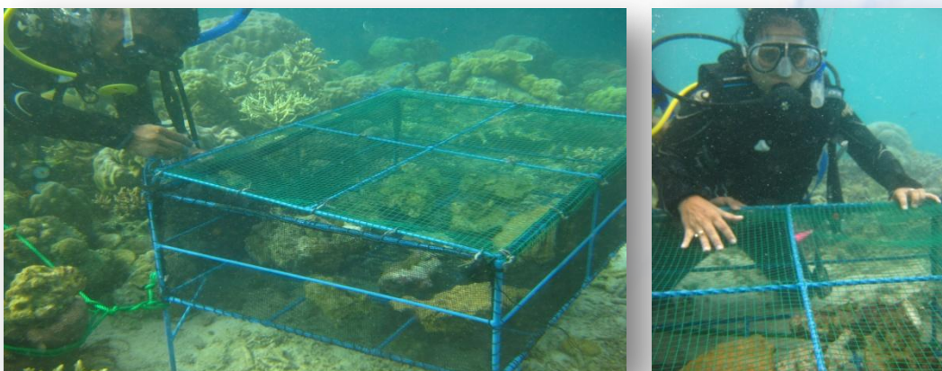
Figure 5 A-B. Installation of the cages and deployment of the juveniles underwater