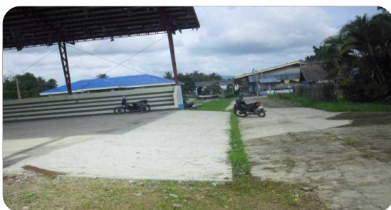
Concreting the Sides of Covered Court (Completed)