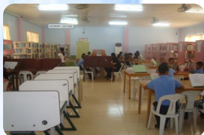
HRM Book Section