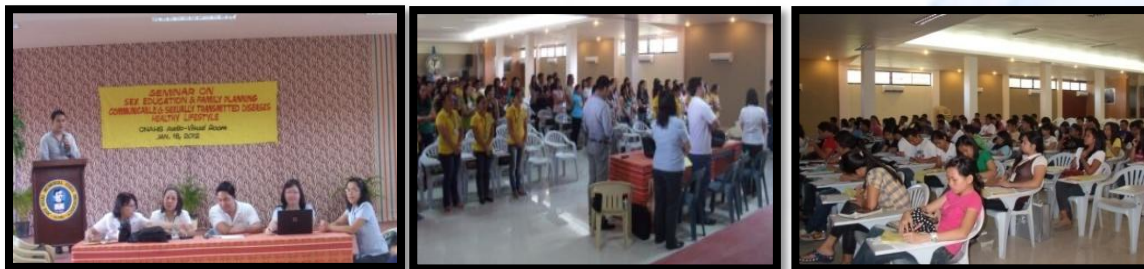
Seminar on Sex Education and Family Planning, Communicable and Sexually Transmitted Diseases, and Healthy Lifestyle held at CNAHS Audio-Visual Room, JRMSU - Main Campus, Dapitan City on January 18, 2012