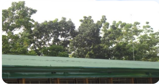
Painting of College of Education Building