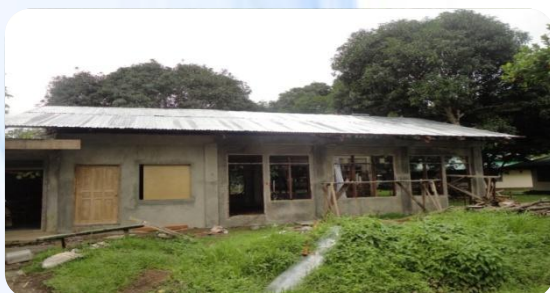
On-going Construction of Corporate High School Office