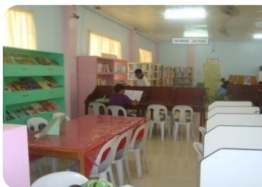
Filipiniana General Circulation