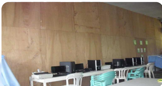
Partition of Electrical Room (On-going)