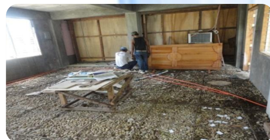
Construction of Comfort Room - College of Education