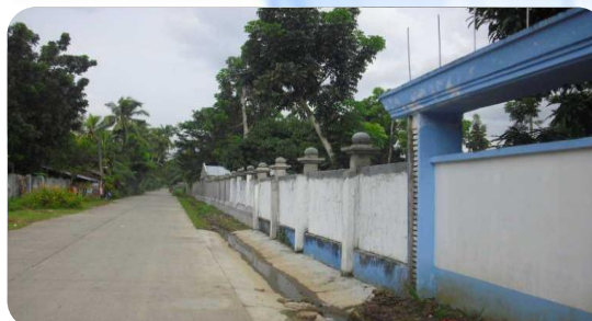
Perimeter Fence Infront of Admin Building (Completed)