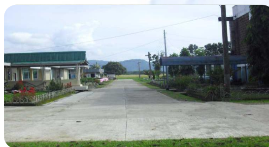
Concrete Pavement from Admin to School Canteen (Completed)