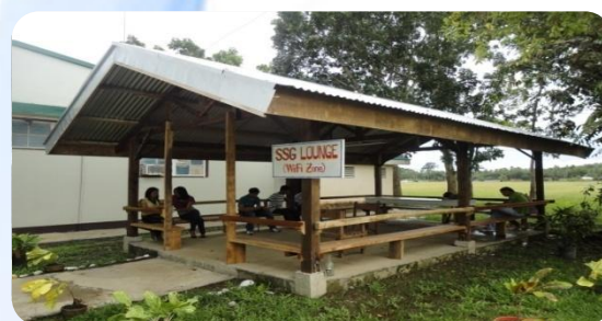
Construction of Student Lounge