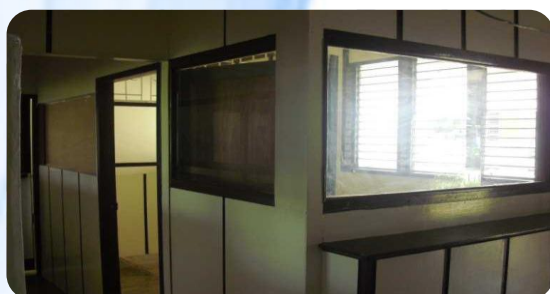
Extension / Lobby of Internet Building (On-going)