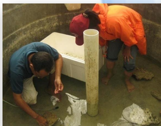
Figure 1 One-year old Hippopus hippopus juveniles were placed on coral rubbles in preparation for restocking