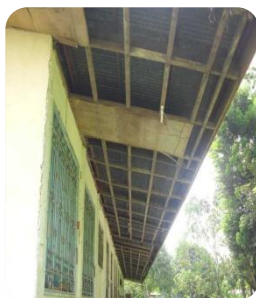
Repair of Ceiling, Roofing & Repainting of Drafting Building (On-going)