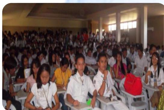
Symposium on Migration and Human Trafficking held at CNAHS Audio-Visual Room, JRMSU - Main Campus, Dapitan City on June 28, 2012